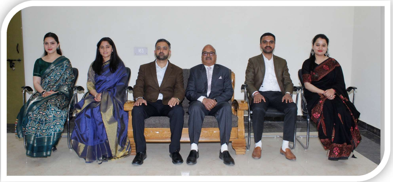
Principal with Teaching Staff