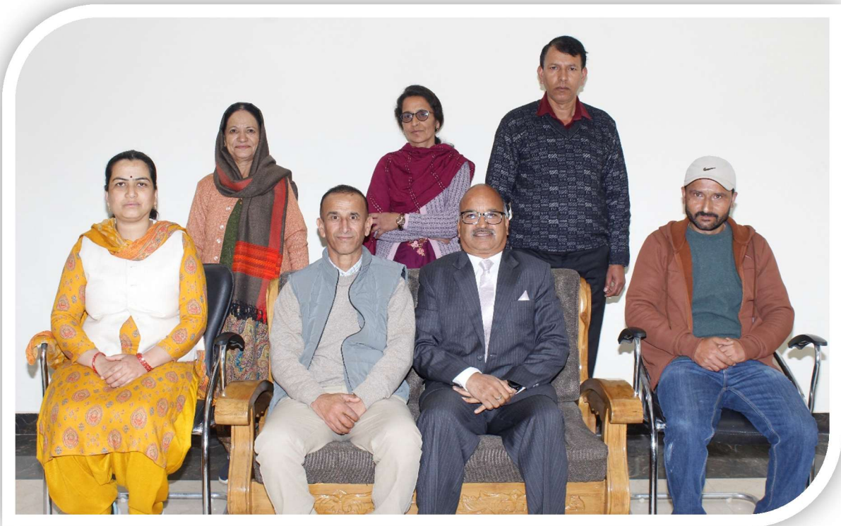
Principal with Non-Teaching Staff Members